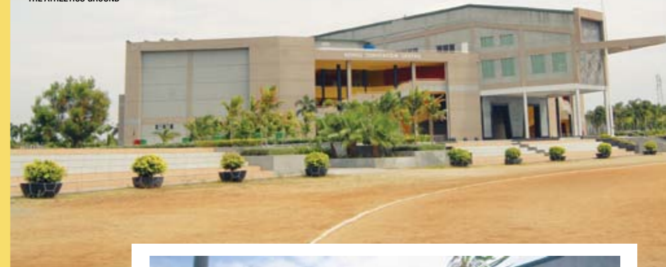
→ VIEW OF THE CONVENTION CENTRE FROM THE ATHLETICS GROUND