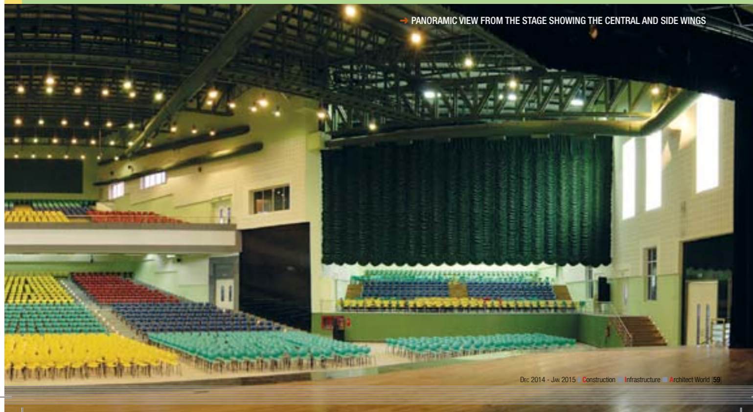
→ PANORAMIC VIEW FROM THE STAGE SHOWING THE CENTRAL AND SIDE WINGS

→ Built on a 23 acre site, Creative Group designed and planned the Kongu Convention Centre at Erode, Tamil Nadu which is one of the largest in India with a seating capacity of 4500 persons. Alternatively it has indoor courts which are used as sports halls.