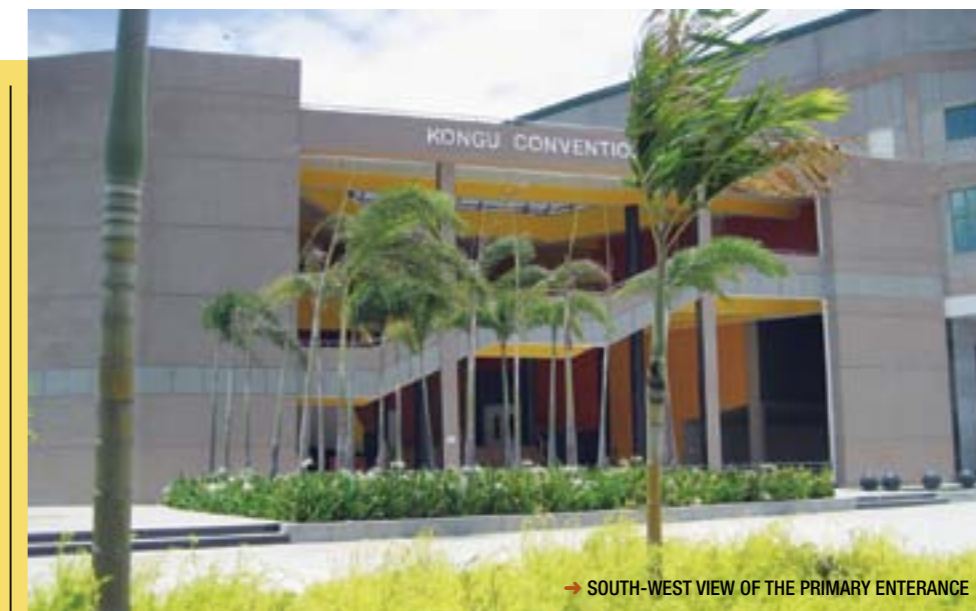
→ SOUTH-WEST VIEW OF THE PRIMARY ENTRANCE

→ The design was optimized beyond the requirements into a multi-purpose convention hall and the client reciprocated this idea with positivity. Executing the project on the established funding, the architects created a facility which could be pertinent and functional for all institutional activities.