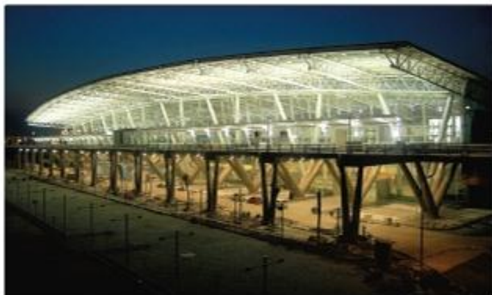
NIFTY NEW Multiple levels of gleaming floors (1,3), a vertical garden (2), a design guaranteed to get no one lost and a swanky entryway (4) are only some of the many features of the terminals